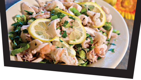
Insalata Di Mare

*extra charge and not available with Calzone