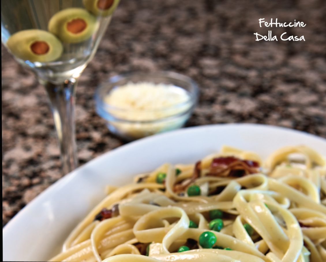
Fettuccine Della Casa