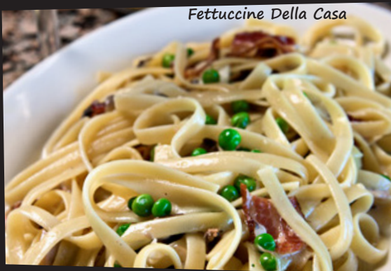
Fettuccine Della Casa

Chicken & Zucchini in a Garlic Alfredo Sauce. Tossed with Rigatoni 19