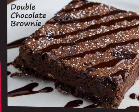
Double Chocolate Brownie